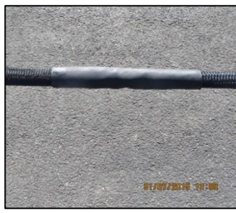
Step 8 Final inspection of the repair, still compressed under tension. Allow Shrink to cool.