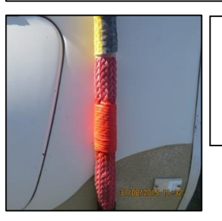
Once fully dried, the strop is repaired and ready to be put back into use.