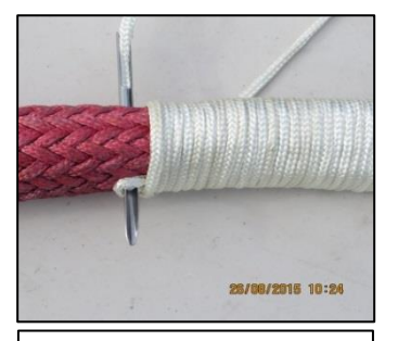
Bring the end of the braid through the Mongoose strop and through the loop.