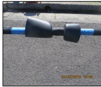
Step 4 Centrally position Shrink Sleeve, heat from centre then out with Heat Gun.