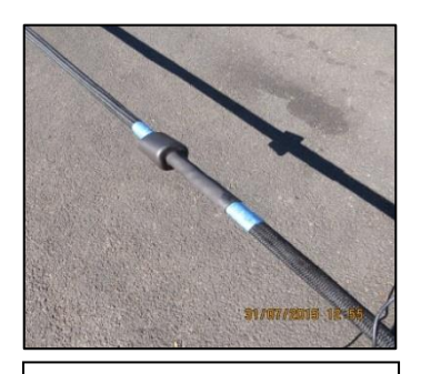
Heat Shrink sleeve one end to edge, masking tape protects fibres at ends.