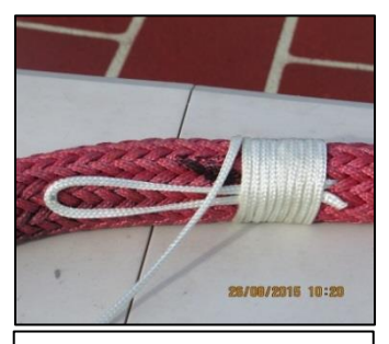
Begin tightly winding nylon braid across the repair section beginning from open loop end.