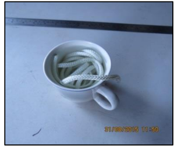
Soak nylon braid in hot water prior to repair, wet nylon braid will shrink when dry.