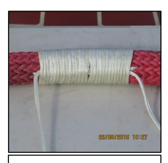
This will leave some excess braid at either end of the whipping.