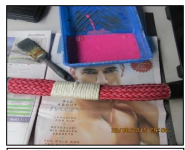
Prepare for coating with Donaghys Urethane Rope Coat with a paint brush to apply.