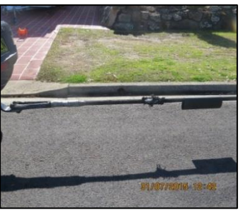
Put loose Shrink Sleeve on the strop and exert reference tension on rope.