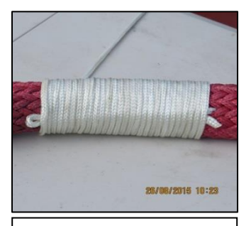
Wrap the braid to the end of the loop fully covering repair section.