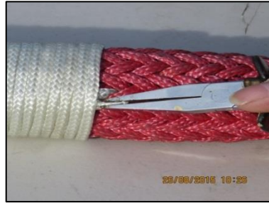
Draw the open end of the loop which pulls the loop to the centre of the whipping to lock in both ends.