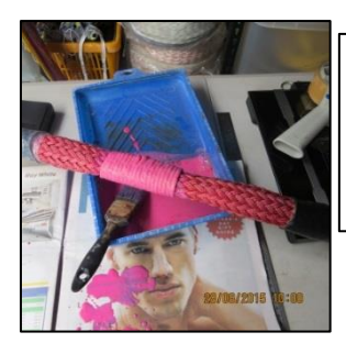
Paint on Donaghys Rope Coat generously, and two coats overall are recommended.