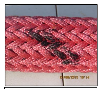
Identify section for repair, clean and tidy to prepare.