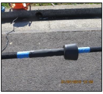
Shrink the other end until firmly shrunken onto the strop.