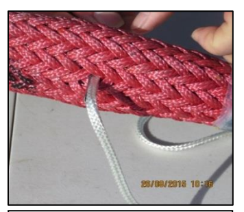
Insert braid through the Mongoose strop one end of repair.