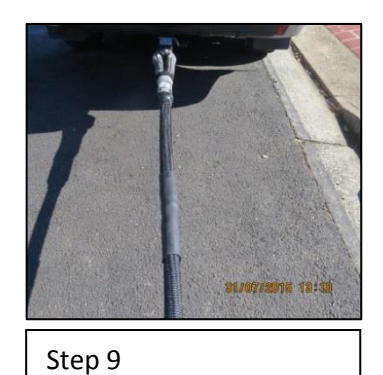
Completed repair, the strop can be released from tension and re-used.