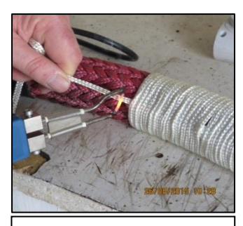
The excess braid can be neatly trimmed.