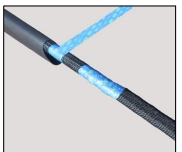
Whilst under tension cover damaged section* end sections with Masking tape.