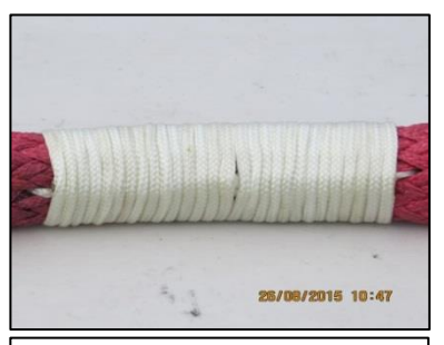
The repaired section is now left to dry. Once dry the braid will be firm on the strop and ready for coating.