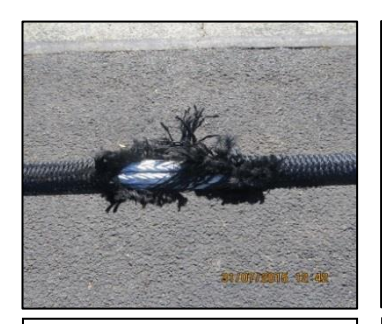
Step 1 Inspect, clean and prepare for repair.