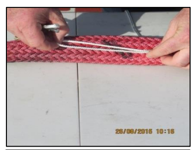
Form a loop of the nylon braid across the area to be repaired above where braid brought through the strop.