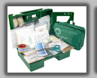
Large Range of Quality NZ Assembled First Aid Packs, Kits and Detachable Wall Units for Vehicles, Offices, Workshops, Stores, Factories, Farms, Forestry, Marine, sports, personal and home with refills