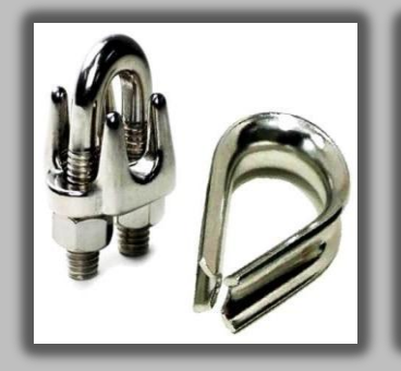
Marine Grade Stainless Steel fittings Available in the most common sizes

All our stainless fitting carry a working Load limit with a 4:1 safety factor