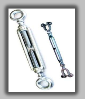
Marine Dacromet coated Wire Rope Grips Hot Dipped Galvanized Turnbuckles and Thimbles

Certified to Din, BS or Federal Specifications