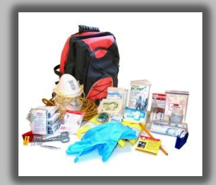
Natural Disasters hit anytime anywhere.. We carry 1 person back packs through to comprehensive 12 person 72hour bins.